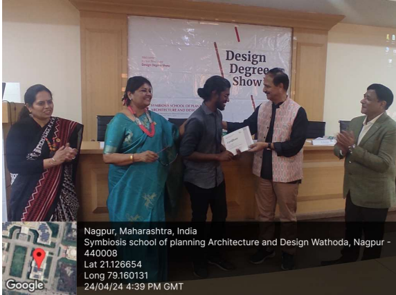
Nagpur, Maharashtra, India Symbiosis school of planning Architecture and Design Wathoda, Nagpur - 440008 Lat 21.126654 Long 79.160131 24/04/24 4:39 PM GMT