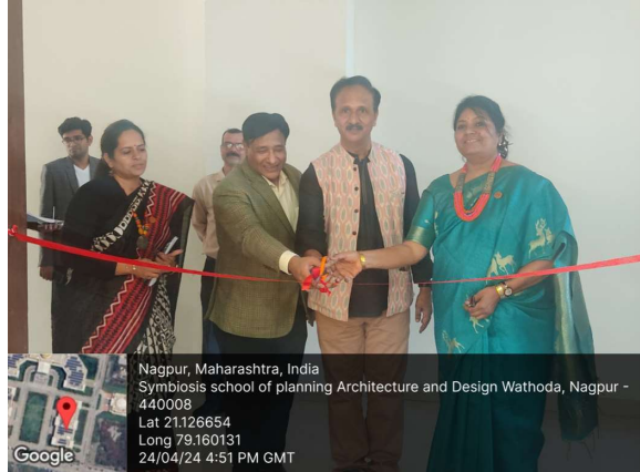
Nagpur, Maharashtra, India Symbiosis school of planning Architecture and Design Wathoda, Nagpur - 440008 Lat 21.126654 Long 79.160131 24/04/24 4:51 PM GMT