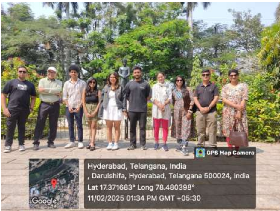
Salar Jung, Hyderabad

The tour began with a visit to the Salar Jung Museum in Hyderabad, a treasure trove of art, history, and culture. Students explored various art forms, including paintings, sculptures, and decorative arts. The museum is home to over 43,000 art pieces, offering students valuable insight into diverse artistic expressions and styles. This visit allowed design students to witness the quality of craftsmanship and artistic innovation, which is beneficial in refining their own design aesthetics. Students spent the whole day at the museum, taking the opportunity to study the intricate details and cultural significance of the displayed art.