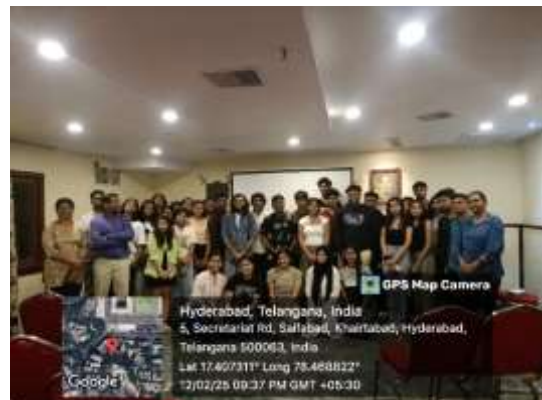
Hotel Amrutha Castle, Hyderabad