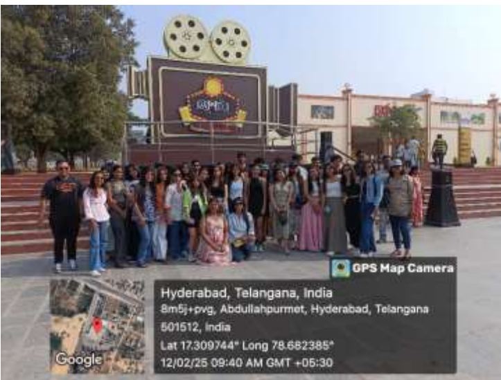
Ramoji Film City, Hyderabad

During the session, the experts shared their industry experiences and provided valuable guidance on bridging the gap between classroom learning and industry requirements. They also offered insights into building portfolios and the essential skills needed to thrive in the design industry. A question and answer session followed, where students interacted with the experts and gained valuable knowledge.