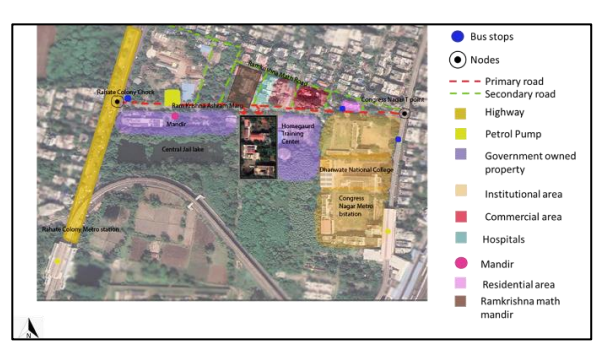
Site and its surroundings