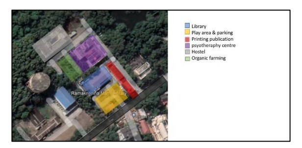
Site plan showing the main library