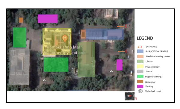
Math site plan