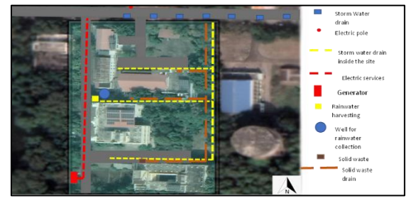
Services on site