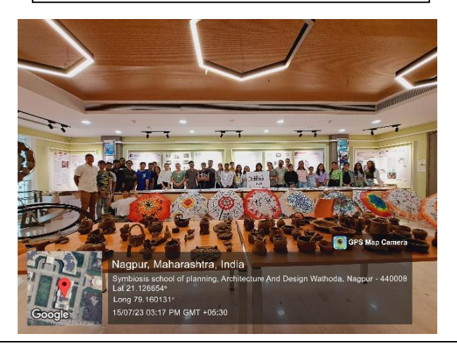
Day 5 – "Pratibimb 23" Exhibition, output of Workshop