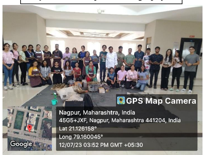
Day 2- Workshop on Clay Modeling & wheel pottery