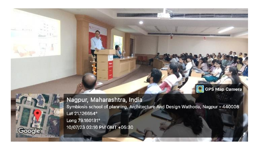
Speech by Campus Administrator, SIU