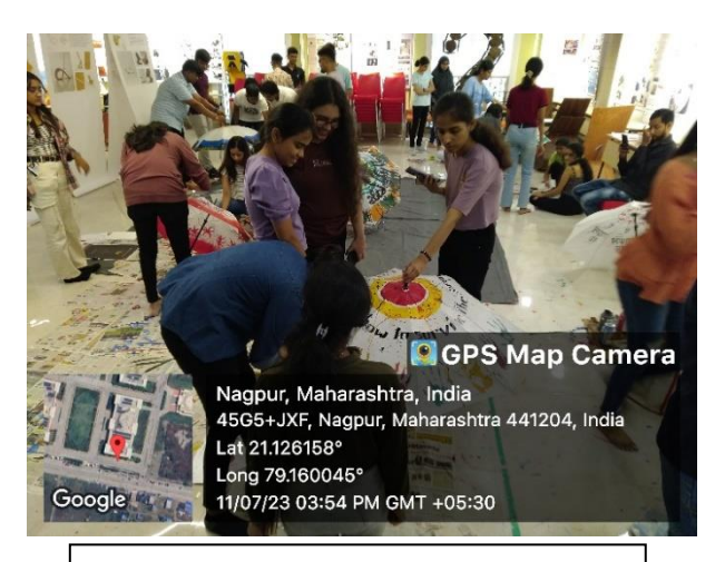
Day 1- Workshop on "Calligraphy"

Symbiosis International (Deemed University)