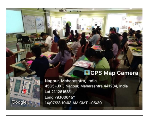
Day 4- Workshop on Modular Origami

Symbiosis International (Deemed University)