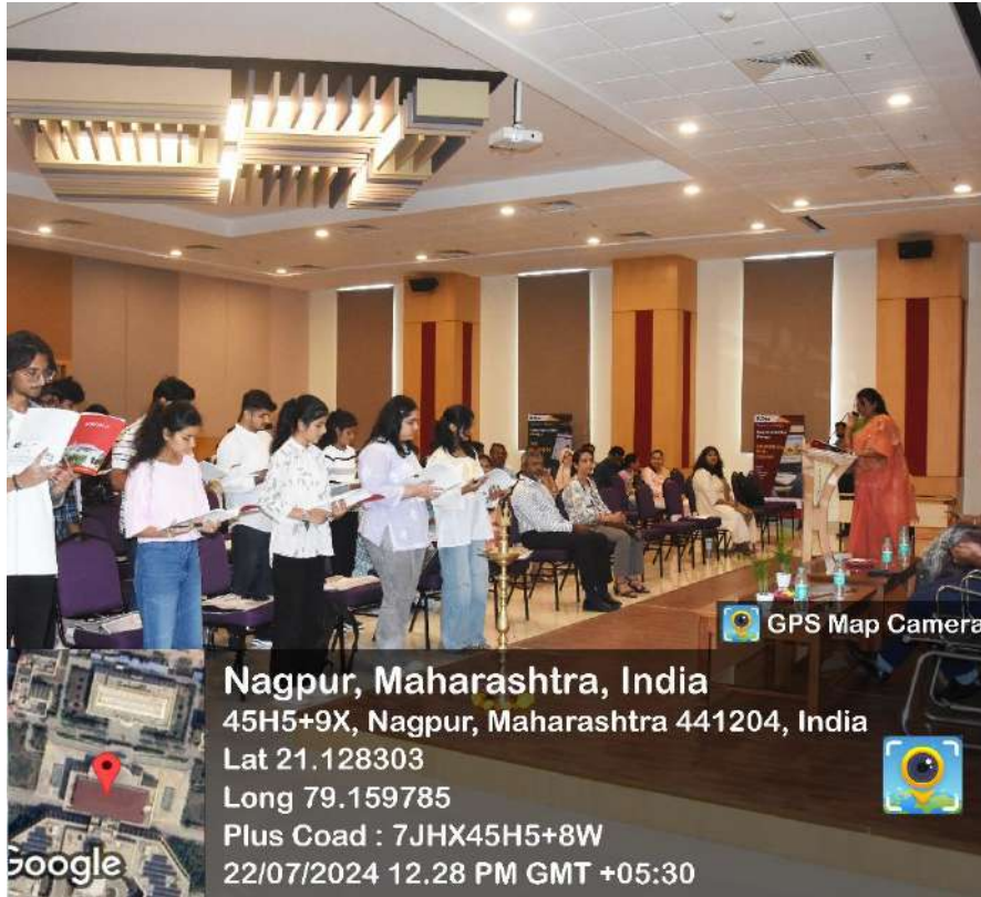
Pledge Taking Ceremony for new Students