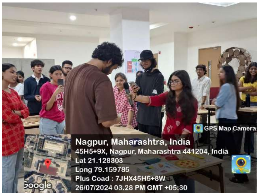
Day 4 – Exhibition