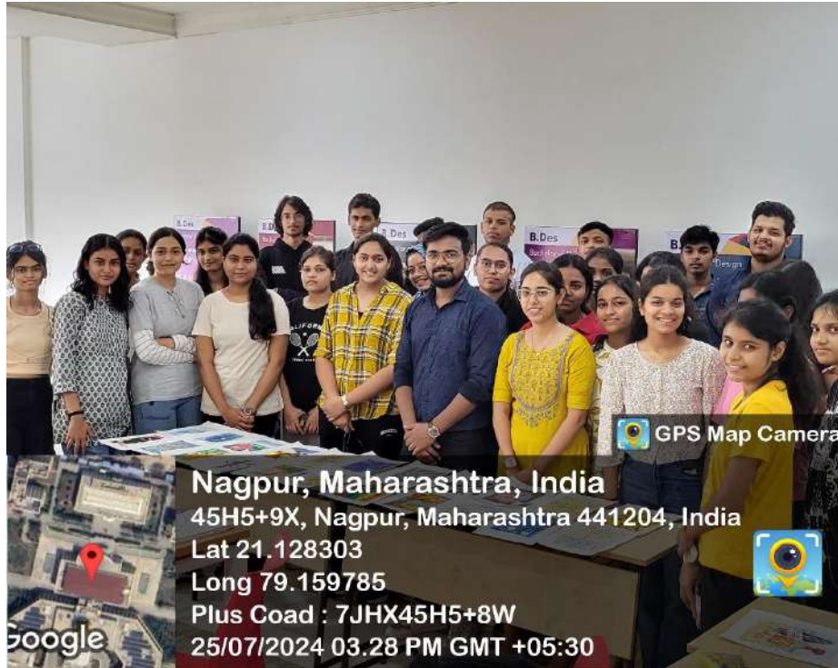
Day 3 – Mono Printmaking Workshop