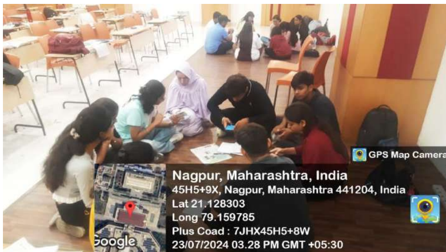
Day 1 – What Paper is not?