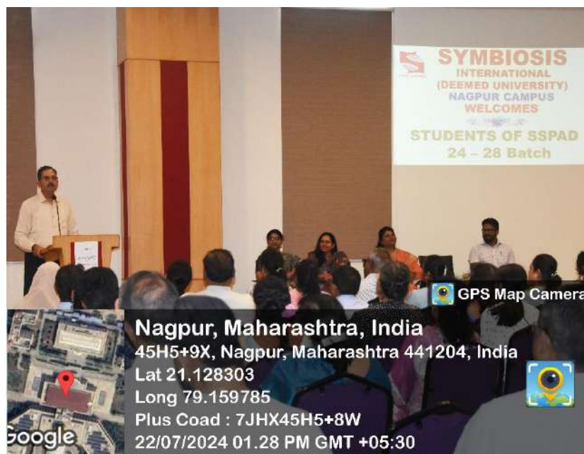
Speech By Campus Administrator, SIU